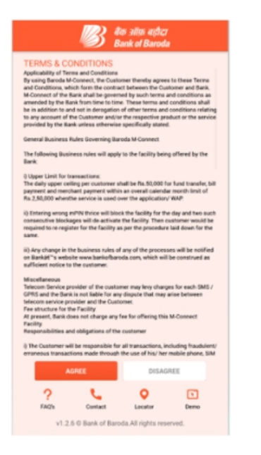
Agree on Terms and Conditions