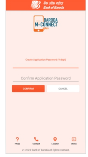
OTP will be generated & Auto - read