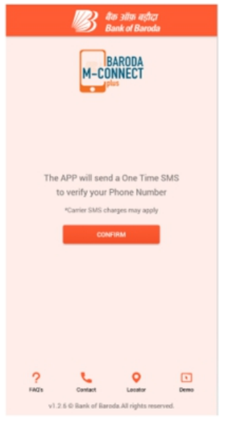
Press Confirm > app will send one time SMS

• GOOGLE PLAYSTORE (for Android users) • APP STORE (for iOS users) • WINDOWS STORE (for Windows users)